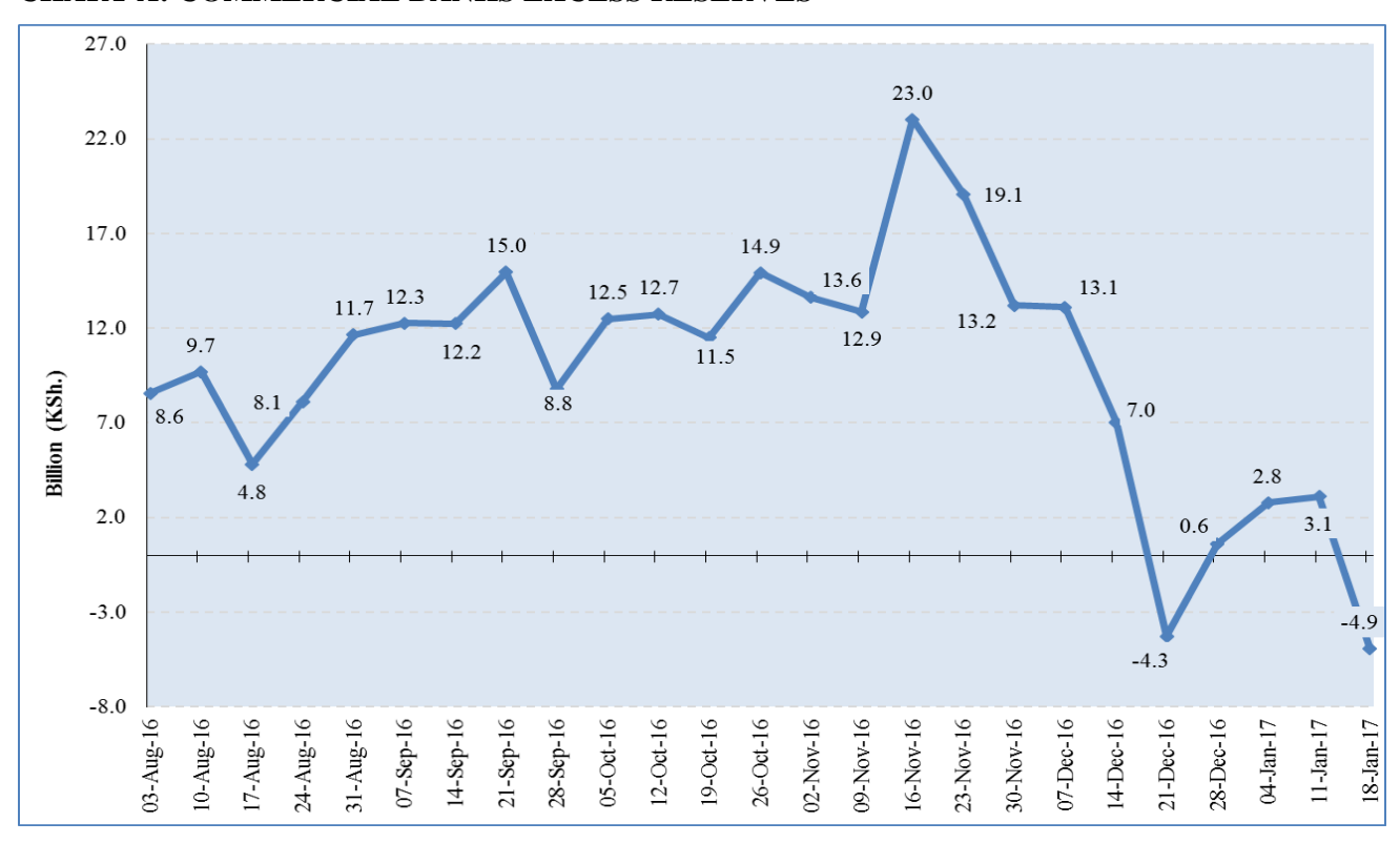
CHART A: COMMERCIAL BANKS EXCESS RESERVES